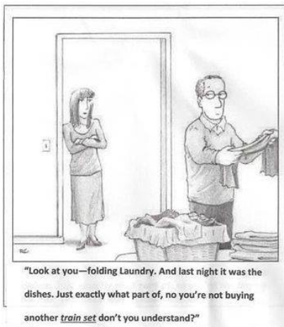
"Look at you—folding Laundry. And last night it was the dishes. Just exactly what part of, no you're not buying another train set don't you understand?"

Please allow two (2) weeks before the next newsletter is published.